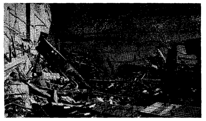
Only twisted rubble remains where the American Hospital Supply Corporation warehouse stood not 24 hours before this picture was taken. AOCS Official Supplies, stored in the adjoining building, miraculously survived the fire.